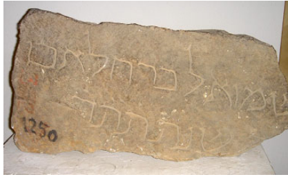
Fragment of matsevah in a museum

In 2001, looking ahead to some work slated for that area of the mount, the City Council of Barcelona undertook a campaign of excavations in a burial plot adjoining the one dug up in 1945. During the work, five hundred and fifty-seven graves and a single “matsevah” (headstone) were found. The complete report of this activity has not yet been completed, but an article with the study’s results was published detailing the morphology of the graves and the analysis of human remains.