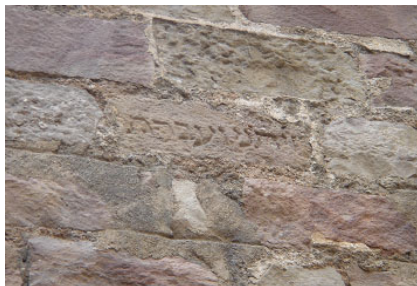
Detail, NW wall of Lieutenant's Palace

Another reference, indirectly and at a later date (1368), seems to confirm the antiquity of the cemetery to the 9th century. It deals with the Jewish community of Tortosa who, upon seeing their cemetery in danger, points out that there are some notable tombs within it, unlike any other place in the kingdom, with the exception of Barcelona “ where some have been there for over 500 years. ”