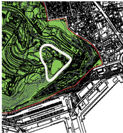
Location of ‘historic place’

When in 2006 the local press informed of the plan for some work which the City of Barcelona intended to carry out on Montjuïc, as a matter of course we were interested in those aspects of the project which might affect the old cemetery area. Specifically, in what is today a very special terrace, with views of the Mediterranean, which is to say facing toward Eretz Israel, they propose making a garden on one side, and a building on the other to provide restrooms and refreshments for the area.