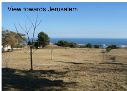
View towards Jerusalem

In the Jewish tradition, respect for the dead includes an absolute prohibition against exhumation, even centuries after burial. This explains the concern that arose in the local and international Jewish world when opening up of graves in the cemetery at Montjuïc was known. As a result of initiation of the proceedings of the BCIN declaration (Cultural Site of National Interest), information was also requested about the fate of the excavated remains in order to re-inter them.